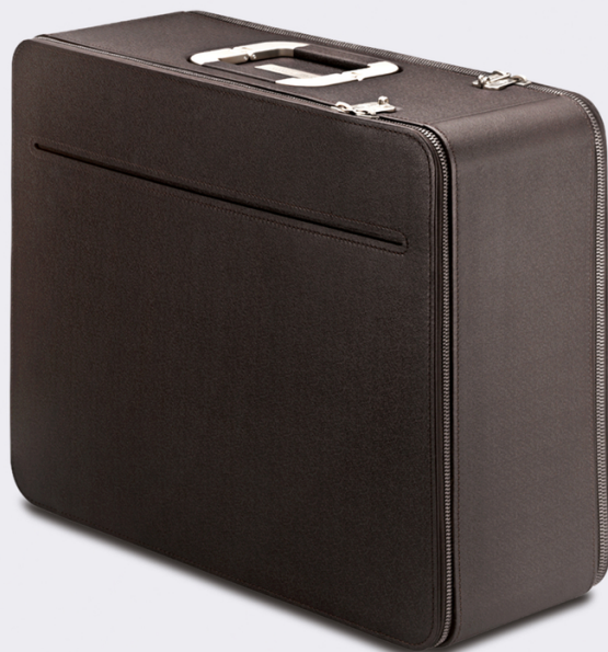
Marc Newson luggage, 48-h briefcase