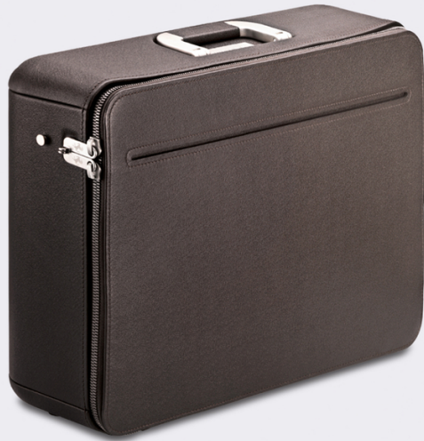
Marc Newson luggage, 24h case