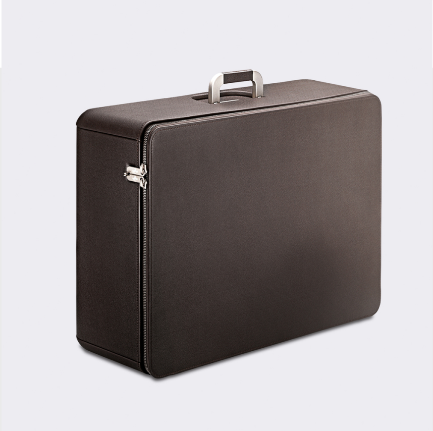
Marc Newson luggage, travel bag