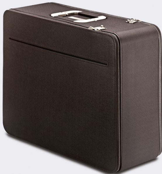
Marc Newson luggage, 48-h briefcase