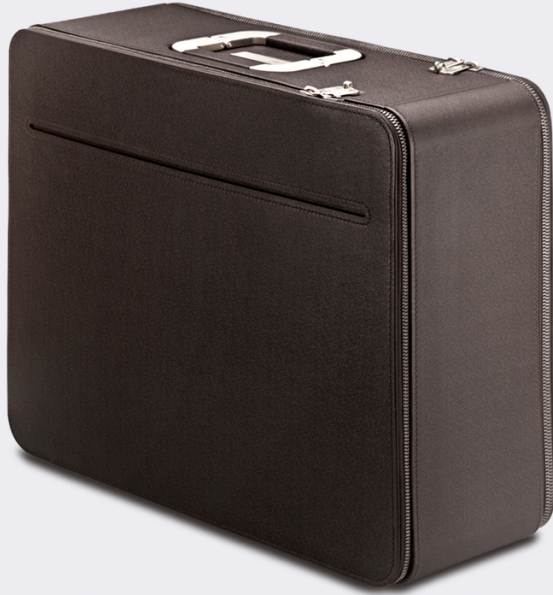
Marc Newson luggage, 48-h briefcase