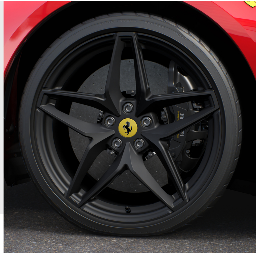
20" forged wheels, matte black