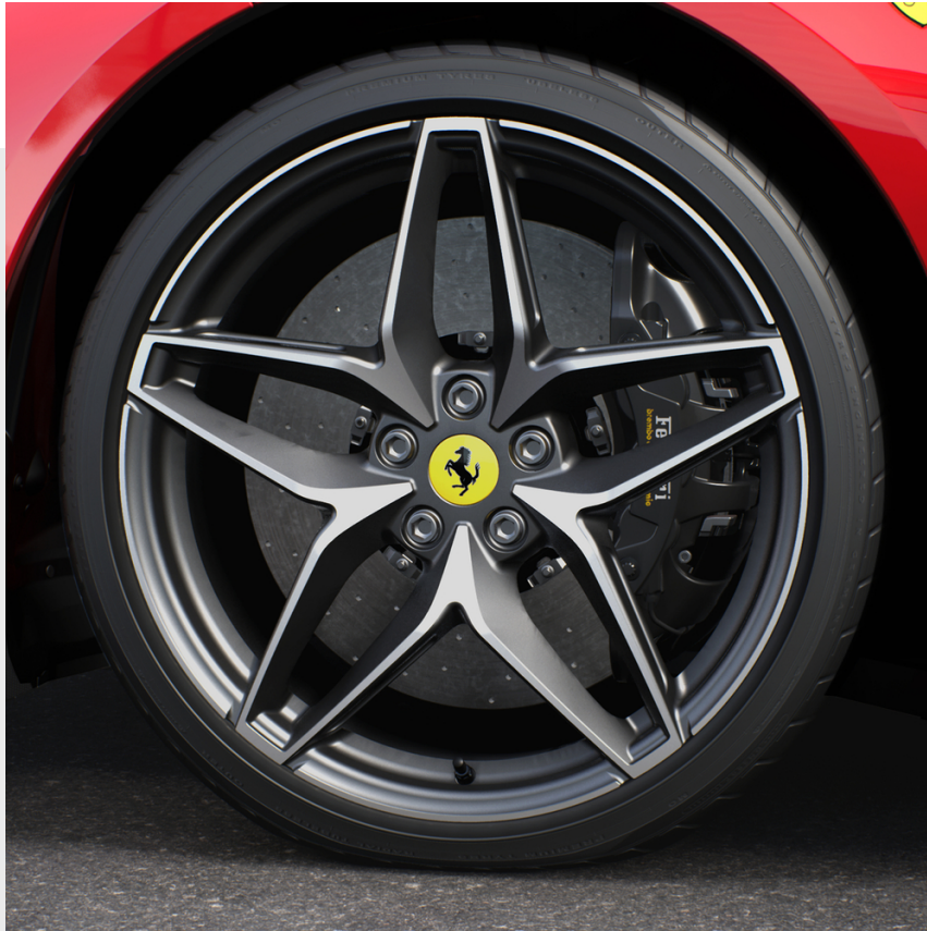
20" forged wheels, matte black two-tone diamond finish