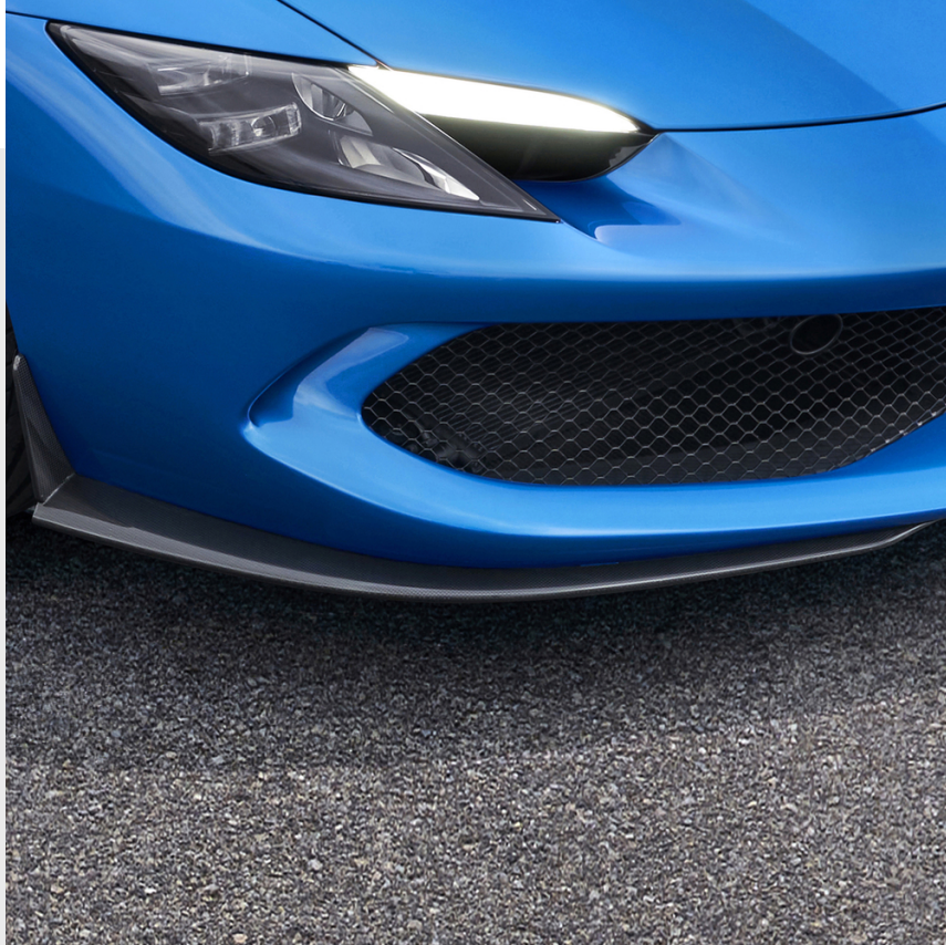
Carbon fibre front aerodynamic appendages