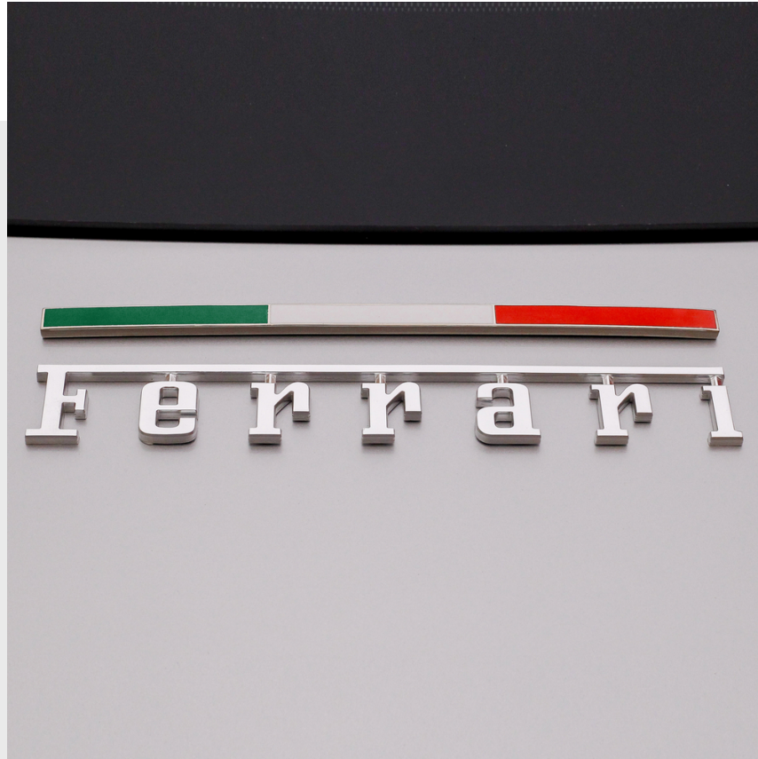
Metallic "Flag" logo, italian flag 12,5cm x 0,5cm