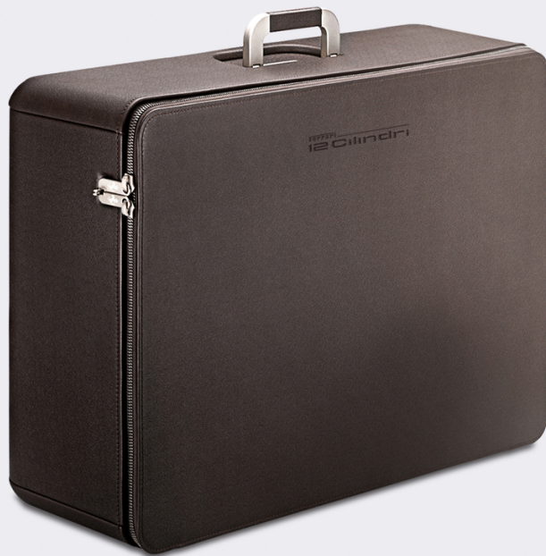
Marc Newson luggage, Suitcase