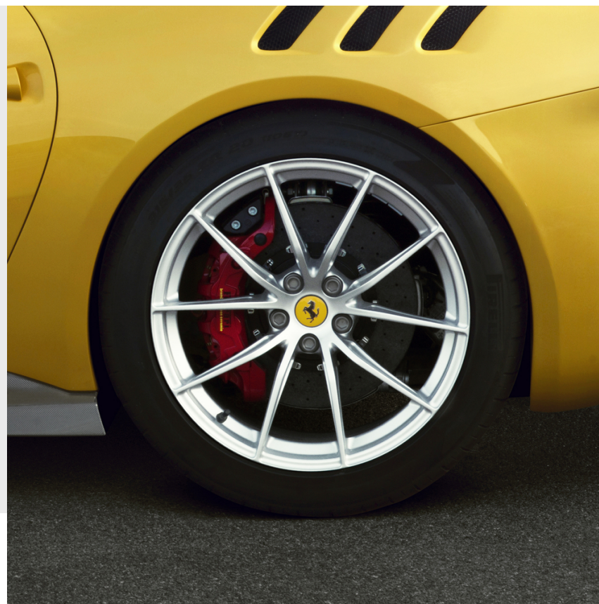
20" multi-spoke forged wheels, matte silver