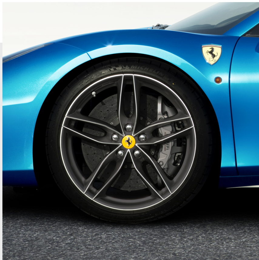
20" forged wheels, two-tone diamond finish