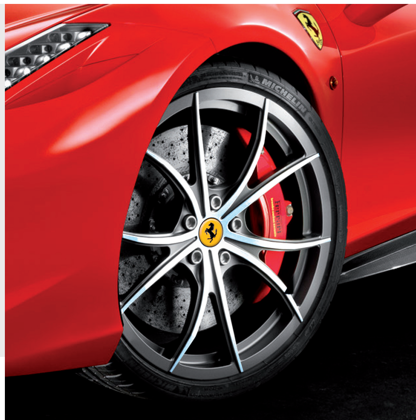
Genuine 20" forged wheels, multi-spoke, matte Grigio Corsa