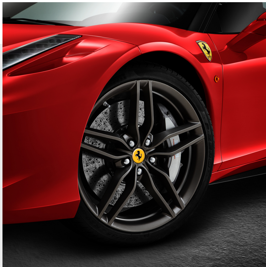
Genuine 20" forged wheels, multi- spoke, Grigio Corsa diamond finish