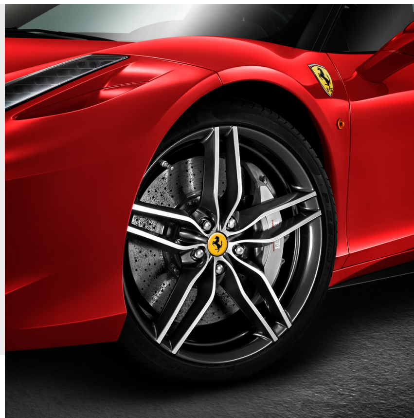
Genuine 20" forged wheels, multi-spoke, matte Grigio Corsa