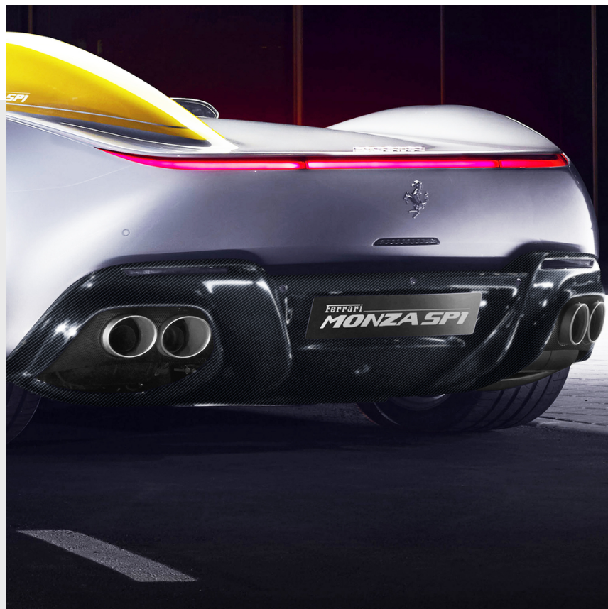
Carbon fiber rear diffuser, for parking camera