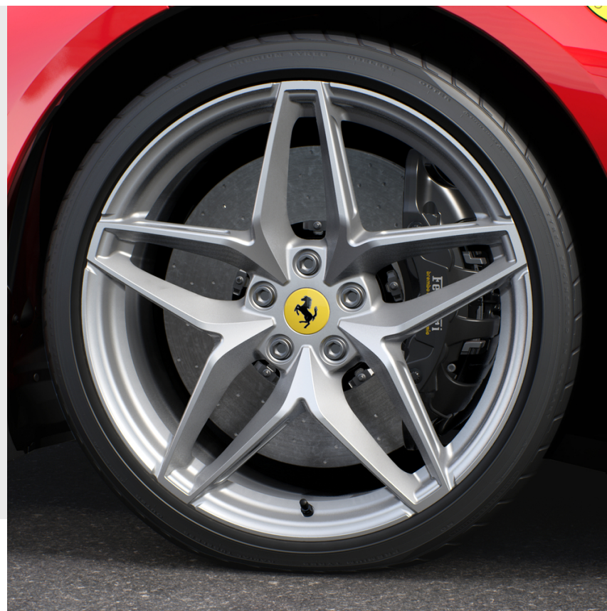
20" forged wheels, matte Argento Nürburgring