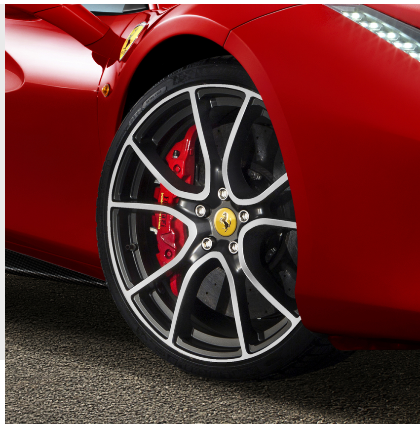
Genuine 20" forged wheels, multi-spoke, diamond finish glossy black