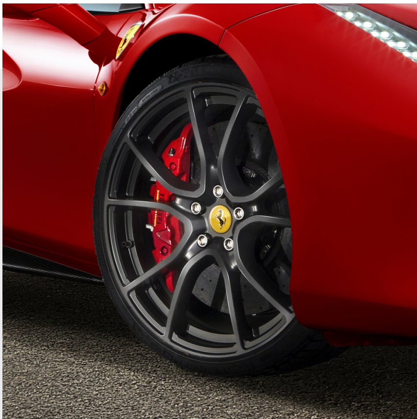
Genuine 20" forged wheels, multi-spoke, matte Grigio Corsa