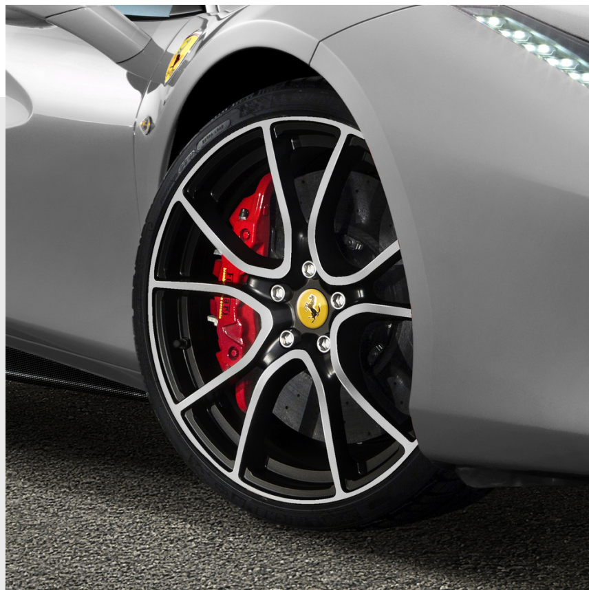
Genuine 20" forged wheels, multi-spoke, two-tone diamond finish