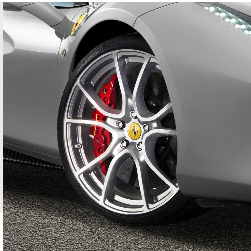
Genuine 20" forged wheels, multi- spoke, paint finish, Race Silver